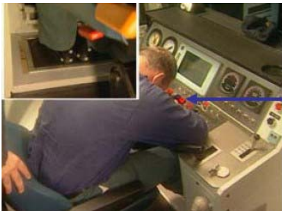
Driver feigning incapacitation with both feet on the deadman pedal.

There were a total of 66 recommendations to come out of the Waterfall accident. All rail operators throughout Australia have been asked to review these recommendations as might apply to their respective organisations and report back to the State Regulator on strategies that will be implemented to mitigate risk if it exists.