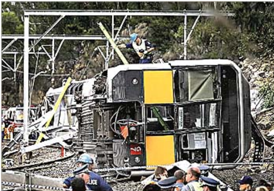
Waterfall – Accident Scene