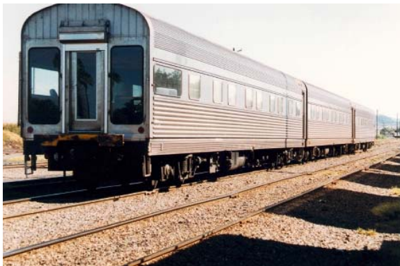
Photo - AK Car Track Recording Car Consist