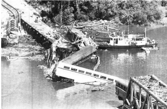
Bridge over the Big Bayou collapsed

22 Sep 1993 - Mobile Alabama USA: Amtrak's Sunset