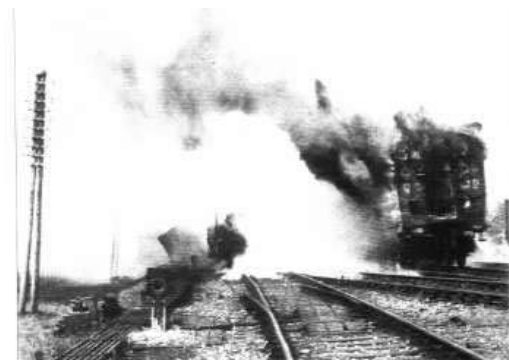
Quintinshill (Gretna Green) Scotland

22 May 1915 - Quintinshill Scotland. Troop train carrying a battalion of the 7th Royal Scots. 227 killed and 246 injured.