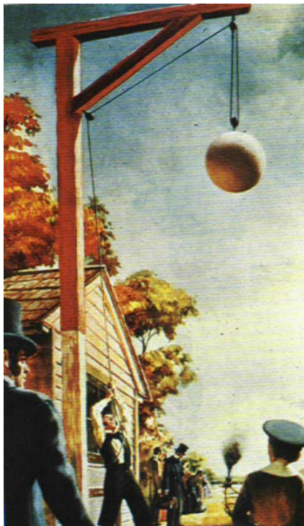
Early "Ball Signal"

Early signalling systems relied upon policemen at stations, crossings and junctions using hand held flags and balls to regulate train movements.