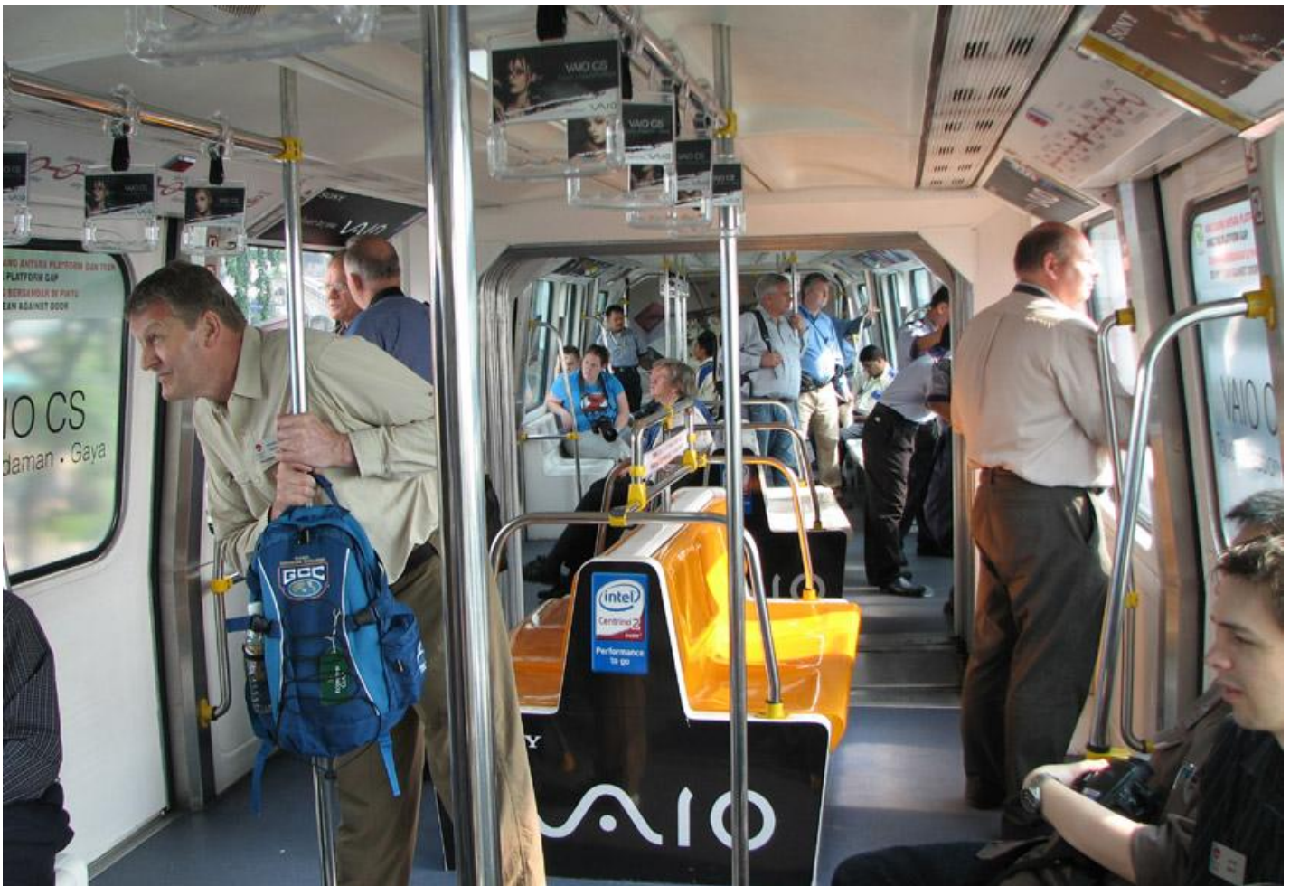
The RTSA Special Monorail in Kuala Lumpur – NSW, Vic, SA and Qld delegates are all visible in this shot

The whole 10 days were truly an eye-opener and those who went will undoubtedly remember it for a very long time. It is also more than likely that there will be a shift in our thinking and concepts in relation to Metros (and other rail activities) as a result of the tour. Those who could have travelled and didn't should make sure they are better prepared for the next one.