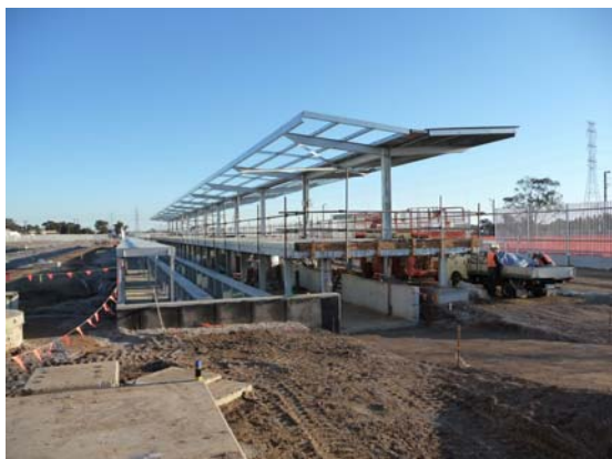
Internal and Major Clean Platform