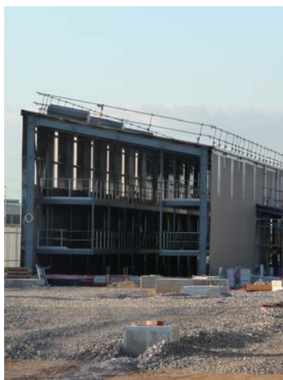
Undercarriage and Roof Wash Facility

The Railway Technical Society of Australasia (RTSA) - NSW Chapter