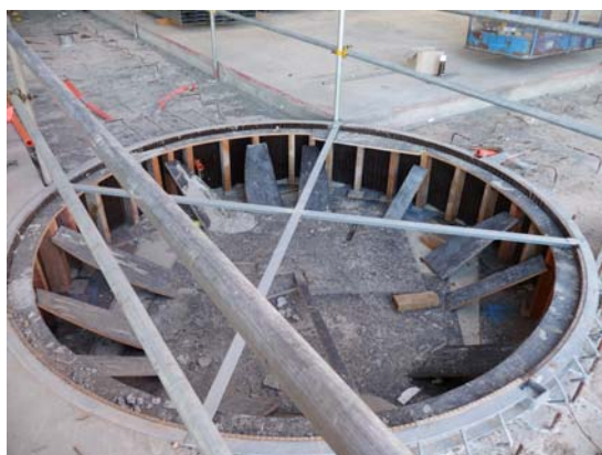
Inside the Main Facility – Pitted Roads and Bogie Turntable