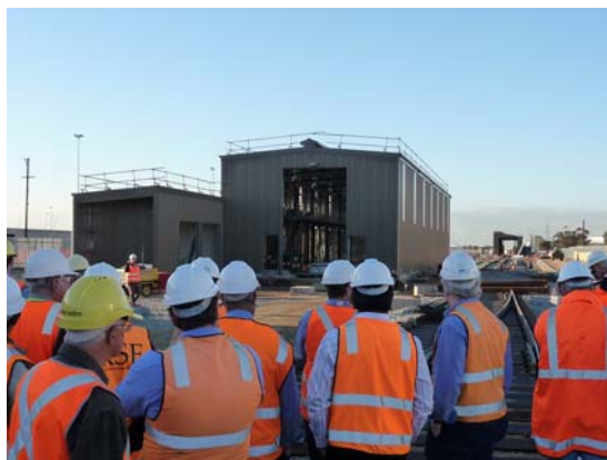
Oil Store and 'A' Service Facility