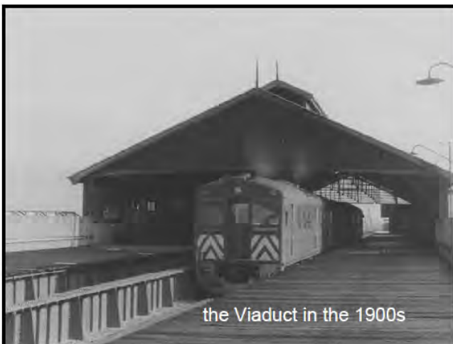
the Viaduct in the 1900s