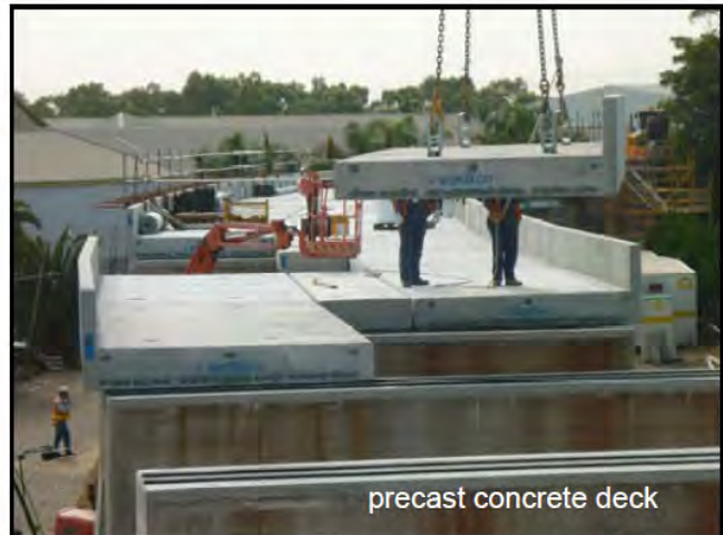
precast concrete deck